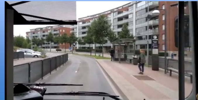
Bus lane & Signal priority