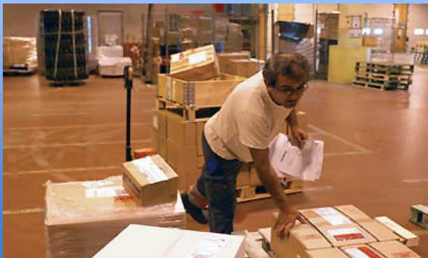
Collaborative city distribution